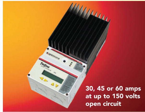
Product shown with optional meter.

The TriStar MPPT features a smart tracking algorithm that maximizes the energy harvest from the PV by rapidly finding the solar array peak power point with extremely fast sweeping of the entire I-V curve. This product is the first PV controller to include on-board Ethernet for a fully web-enabled interface and includes up to 200 days of data logging.